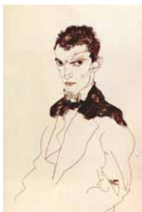
Egon Schiele Self portraits