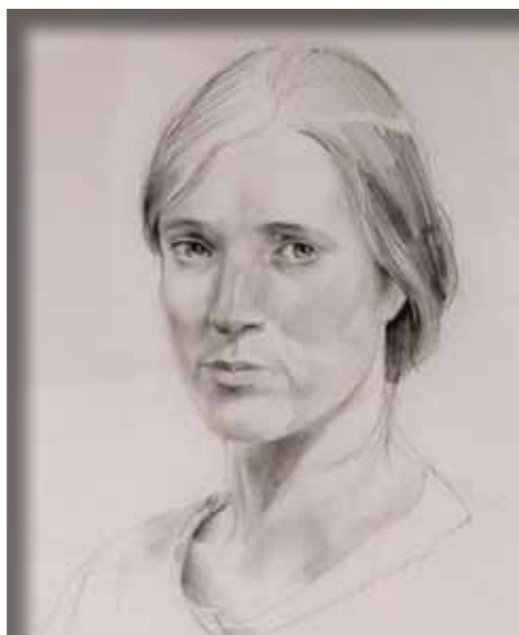
Peter Roos / Drawing