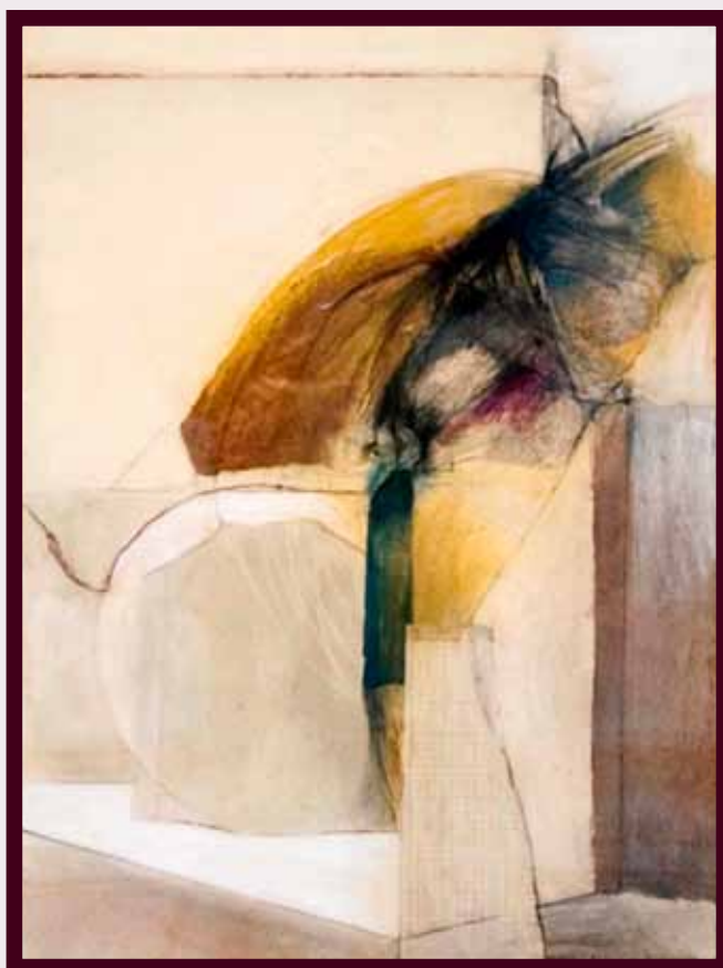
Dona Schleisier / Collage