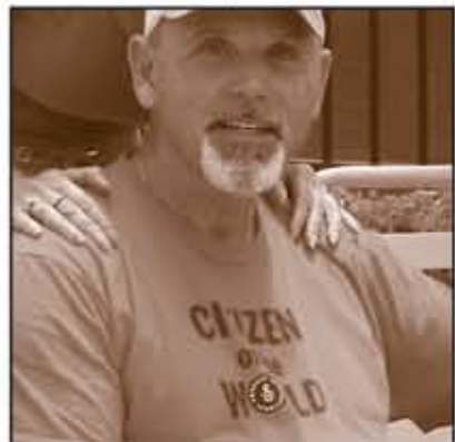
Citizen of the World