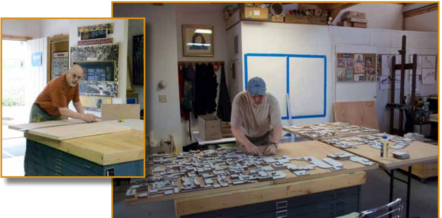
With the studio doors open behind me I am gridding off the wooden panels to help me align pieces that you see me temporarily laying out in the second picture. When complete there will be 9 panels joined together. After I am satisfied with the arrangement, I copy the layout onto a second panel gluing each piece in place as I go. I don't transfer the pieces from one to another because I need to see the whole composition as I finalize each panel, so I choose identically shaped pieces from boxes of sorted shapes (behind me in picture 2).